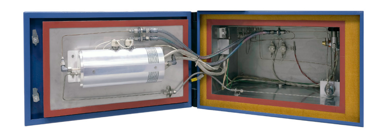
Figure 2 SOLA iQ Flare analyzer oven and pyrolizer assembly

For the SOLA iQ Flare analyzer the sample line enters the oven directly and the injection valve is always located within the oven to enable the appropriate temperature to be maintained.