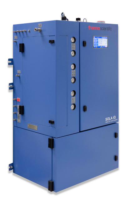
Figure 6 SOLA iQ Flare analyzer